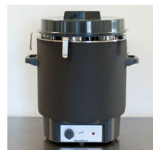
Art. 8401.01 Insulation blanket (order separately)

Tankcapacity: 27 liter Height: 450 mm Depth: 300 mm Diameter: 350 mm Power requirements: 800 Watt / 230 Volt