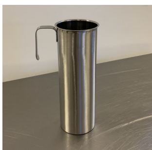
Art. 8431 Pouring can 1,5L (order separately)