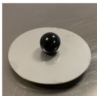
Art. 8431.01 Lid for pouring cylinder (order separately)