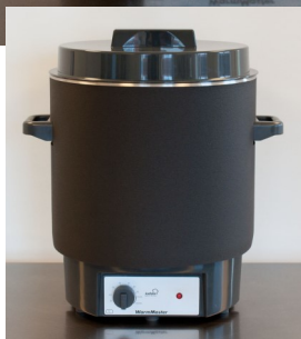
Optional Insulation Blanket (art 8401.04)