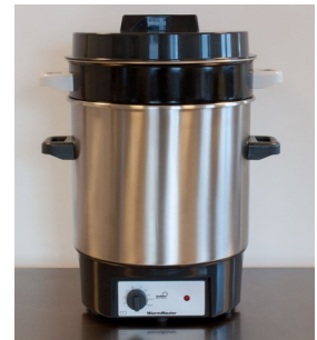
Optional 20L Enamel Insert Pan (art. 8401.01)