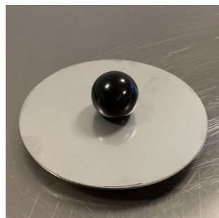
Art. 8431.01 Container lid (order seperatly)