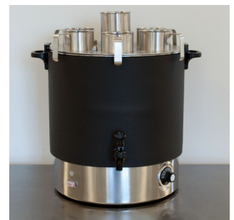
Art. 8401.01 Isolation blanket (order seperatly)

Tankcapacity: 30 liter Height: 520 mm Depth: 290 mm Diameter: 400 mm Power requirements: 2200 Watt / 230 Volt